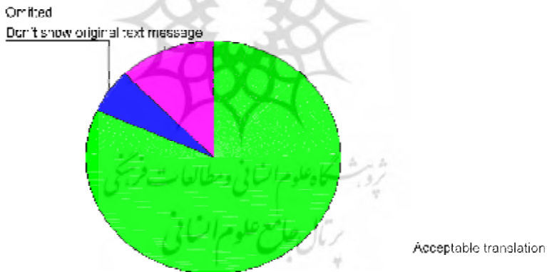
Figure 2 shows the statistics